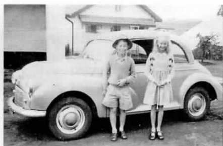
Two angelic looking Gerrards and 'The Hip Bath!