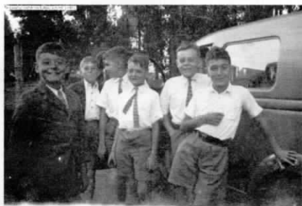
A Sunday outing from Kitale School - 1950 era